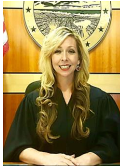
JUDGE SHERRY L. GLASS