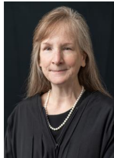
JUDGE LISA I. SWENSKI

Please visit us on the web for a detailed overview of the Court, program descriptions, list of contacts, and frequently asked questions.